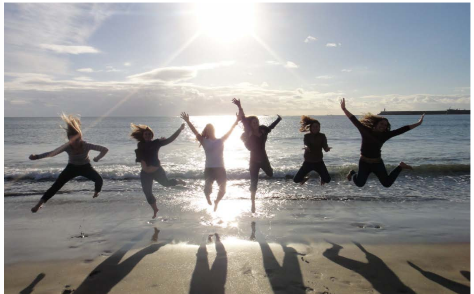
Some of the Semester in France students while visiting Portugal

Although the job market might be slowly improving, it is more important than ever to stand out from other applicants however possible. Research shows that studying abroad gives students additional qualifications that can improve their chances of landing a position.